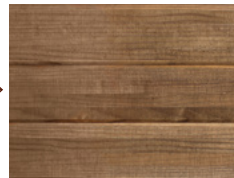
Vulcan Teak Weathered exterior install

We cannot guarantee against wear or color changes to any products which result from weather, sun, wind and/or the natural aging process of the wood.