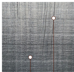
Laminated glue seams