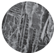
Cell structure – normal kiln dried timber