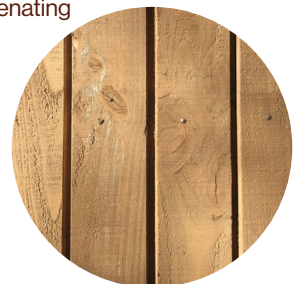
Tundra – weathered 12mo